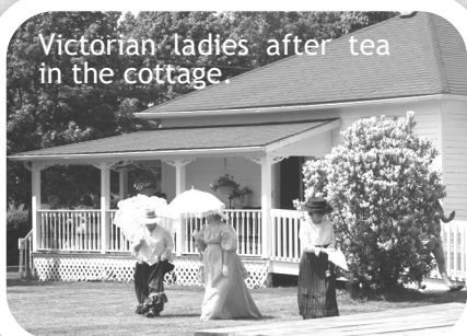
Victorian ladies after tea in the cottage.