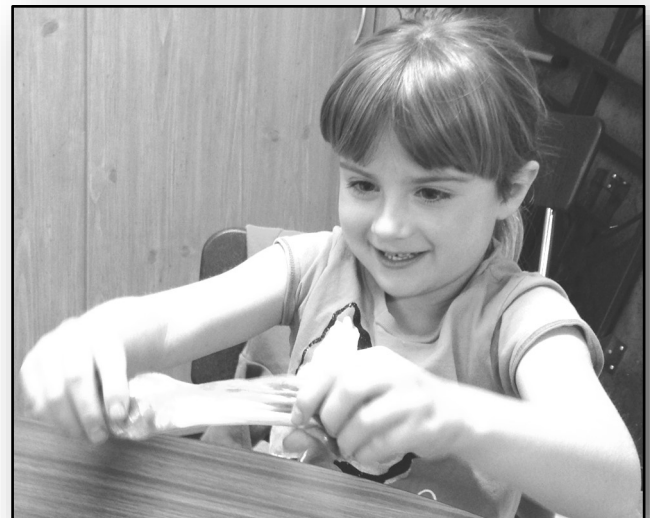
A student participating in the Community Christmas Celebrations program works to create the perfect pulled taffy.