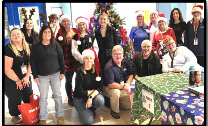
The busy volunteers take time to commemorate the inaugural Industry Takeover Day with a group photo.

Here are the companies that showed generous Christmas spirit: BASES, Imperial, Suncor, Arlanxeo,