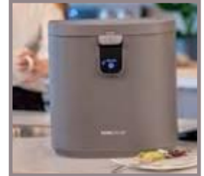
ECO 5 Maestro