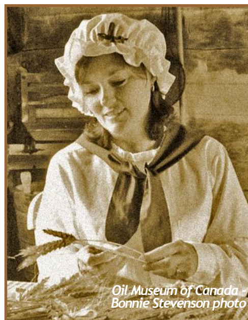
Oil Museum of Canada