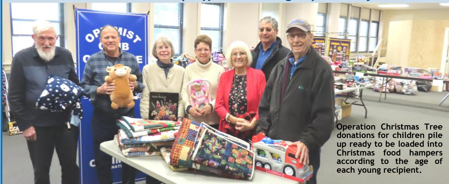
Operation Christmas Tree donations for children pile up ready to be loaded into Christmas food hampers according to the age of each young recipient.