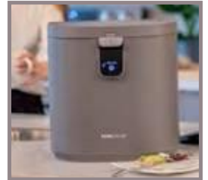
ECO 5 Maestro