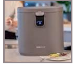
ECO 5 Maestro