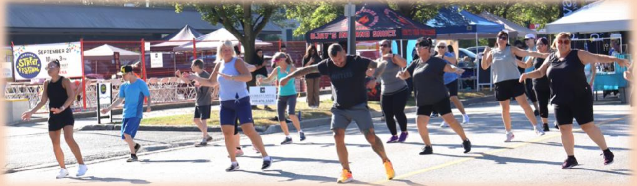
The Zumba Wake Up group was out in the morning sunshine to dance and energize the visitors as they entered the festival grounds.