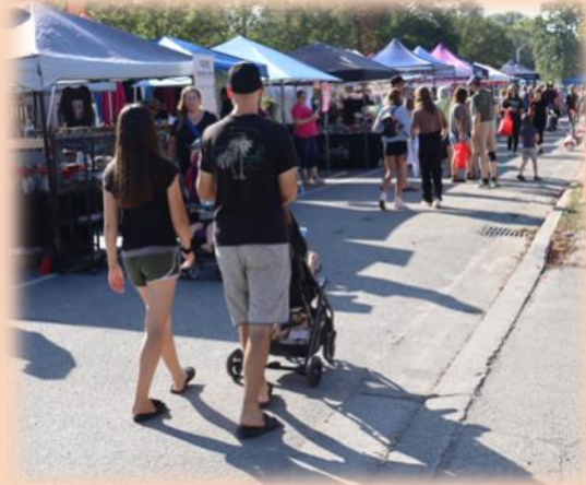
In the vendor mall on Lyndoch Street, 41 shops offered shoppers, collectors, and those who seek special gifts for special people, a wide spectrum of merchandise for every taste.