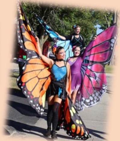
Beautiful butterflies stilt-walked down Lyndoch Street sidewalks greeting their admirers along the way.