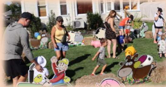
Life in the farmyard had its ups and downs as some of the kids in the pen bounced around on their chubby rubber piggies.