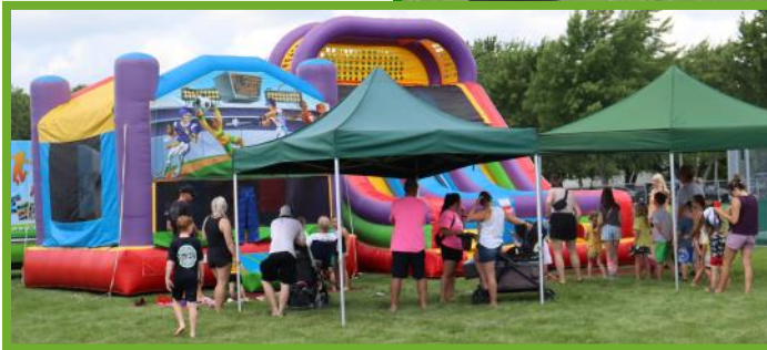
Left: The adults weren’t the only ones having fun at Sombra Days. The bouncy inflatables sent happy squeals and shouts across the park.