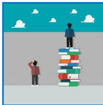
Reading lifts you up!

At the conclusion of the Lambton 175th Show & Tell events, a presentation highlighting some of the most interesting artifacts will be held at Sarnia Library Theatre on Wednesday, October 9, at 6:30 p.m. For more information visit lambtonmuseums.ca/show