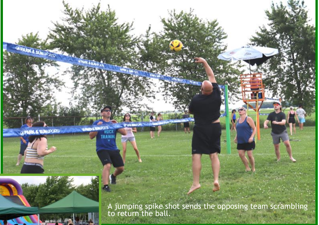
A jumping spike shot sends the opposing team scrambling to return the ball.

It’s Sombra Days at the volleyball court and the joint is jumpin’