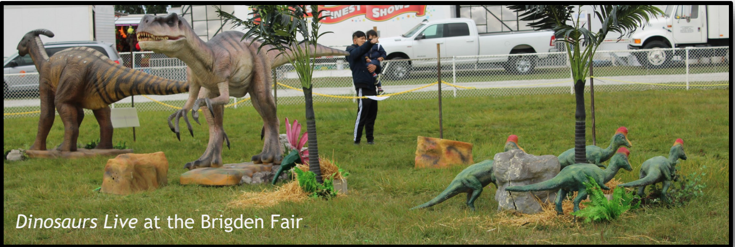
Dinosaurs Live at the Brigden Fair

Above: The thrilling animatronic Dinosaurs Live exhibit turned a field into a moving, roaring Jurassic wonderland. The exhibit is the travelling arm of Canada's Dinosaur Park . Established in 1998, the park became a training facility for all Canadian Federal Wildlife Officers and other government agencies. For more information, go online to: dinosaurslive.org .