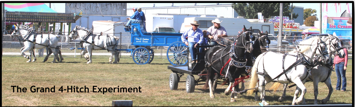
The Grand 4-Hitch Experiment

Above: The thrilling animatronic Dinosaurs Live exhibit turned a field into a moving, roaring Jurassic wonderland. The exhibit is the travelling arm of Canada's Dinosaur Park . Established in 1998, the park became a training facility for all Canadian Federal Wildlife Officers and other government agencies. For more information, go online to: dinosaurslive.org .