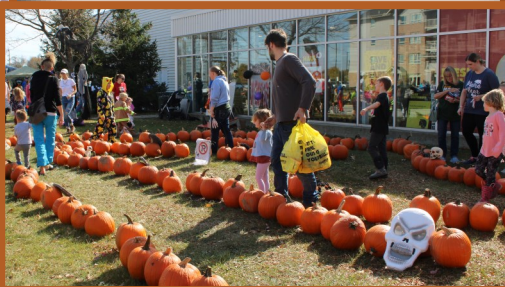
Above: The pumpkin maze was enjoyed by parents as well as their children.