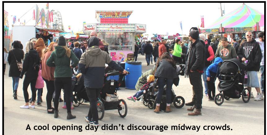
A cool opening day didn't discourage midway crowds.