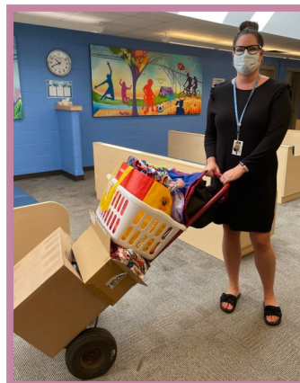
Homecraft Division photos