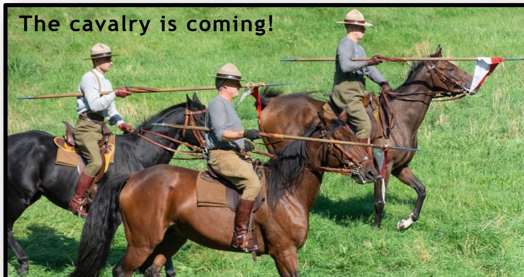
The cavalry is coming!

Weapons used by the group are the P08 sword, P68 lance, and the Lee Enfield Rifle Mk3. These weapons are the same as those used by the Canadian army in WW1.