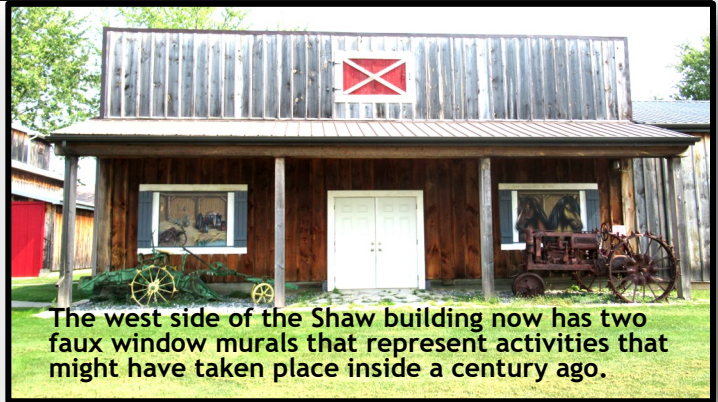
The west side of the Shaw building now has two faux window murals that represent activities that might have taken place inside a century ago.