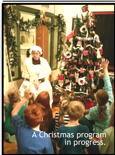
A Christmas program in progress.