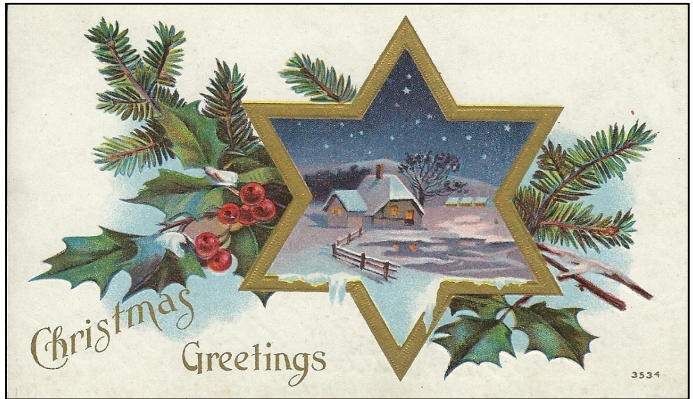
Victorian greeting card from the Moore Museum archives