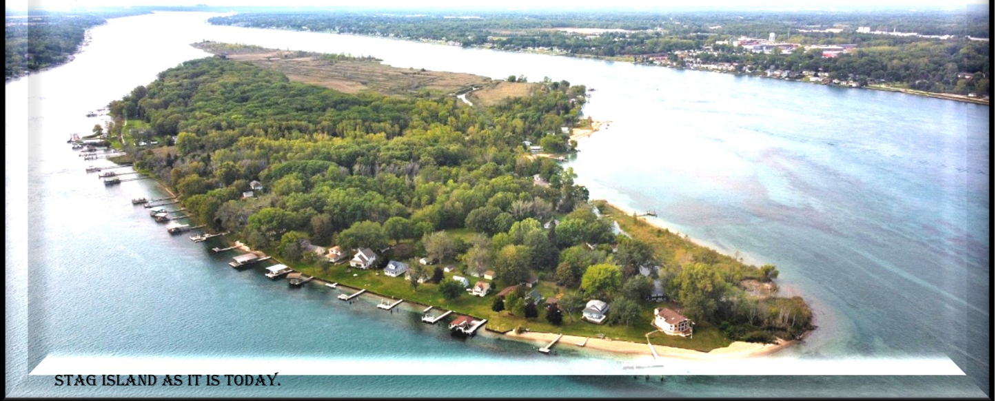
STAG ISLAND AS IT IS TODAY.

Stag Island, now a cozy summer cottage retreat, was once a summer holiday destination for city dwellers like Windsor and Detroit who reached the island via steam ships like the Tashmoo and the Greyhound . Local residents could ride from Corunna to the island on a steam yacht owned by the David family. This turn-of-the-20th century resort island boasted a 103-room hotel, up to 23 cottages, beaches, and sports and amusement areas that included tennis, croquet, boating and fishing. A second 100-room hotel was soon built, and all park buildings were illuminated with electric lighting. But after WWI, the island's popularity began to wane and not even the