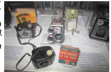
Cameras without phones?