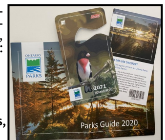
Above: The Ontario Parks pass, park guide and $5 coupon.

ext. 5266 or 1-866-324-6912, ext. 5266, or email: librarytechhelp@county-lambton.on.ca . For more information on locations, services, and hours of operation, go online to: www.lclibrary.ca .