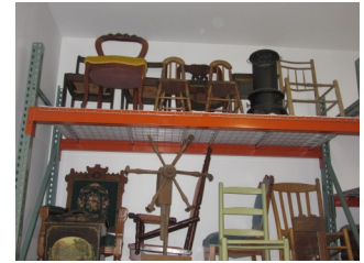
Heritage furniture in reserve