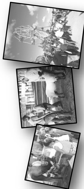
Exhibit pickup will be Monday, Oct. 14 at 4:30 p.m.

(ET) Entertainment Tent (C) Coliseum (CS) Community Showcase (LS) Lumberjack Stand (EXH) Exhibition Hall (CB) Cattle Barn #1 (G) Grandstand