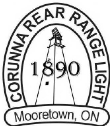
Range light stamp design

The recently refurbished rear range light is open to the public during regular museum hours. Check it out, along with all of the fantastic buildings and displays to be found at the Moore Museum in Mooretown.