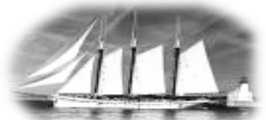
The Empire Sandy

The ships will be participating in the Tall Ships Challenge Great Lakes 2019 race series. For more information, visit the event's Facebook page.