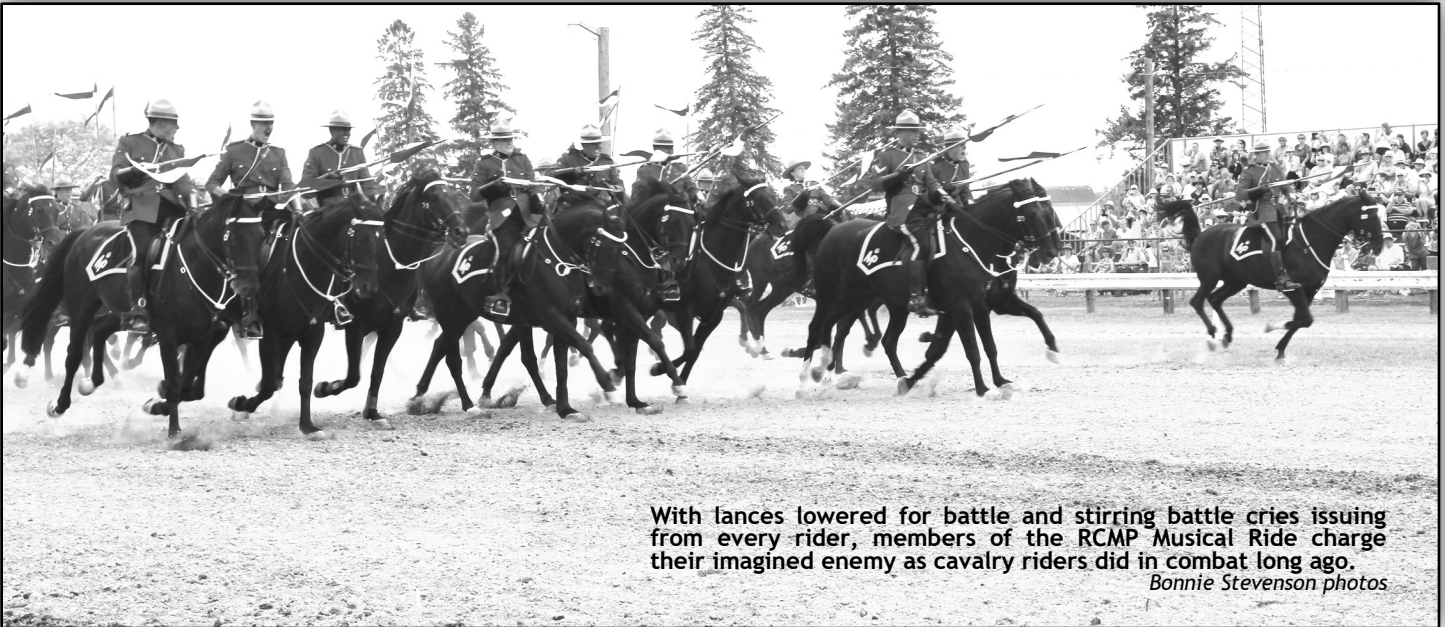
With lances lowered for battle and stirring battle cries issuing from every rider, members of the RCMP Musical Ride charge their imagined enemy as cavalry riders did in combat long ago.