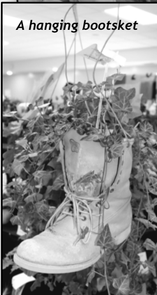
A hanging bootsket