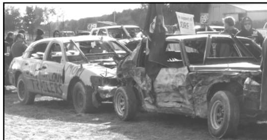
Used car, anyone?

1st - Chad Mitchell - 1/2 ton Chevy #8 2nd - Dylan Grant - 96 GMC Sierra #73