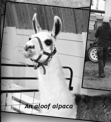
An aloof alpaca