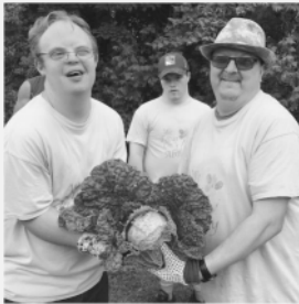
Proud members of the Ruth's Place group hold up one of the cabbages they grew at Smith Homestead.

That first visit became a horticultural therapy program and eventually led to the group starting a charitable food donation program for the Petrolia food bank and Heaven's Wildlife Rescue in Oil Springs.