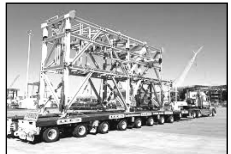
An oversized load reaches the construction site.