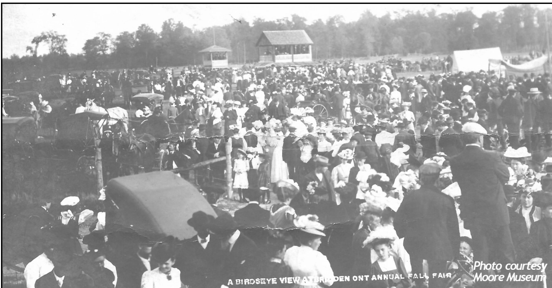
A BIRDSEYE VIEW AT THE BRIGDEN ONT ANNUAL FALL FAIR

The Brigden Fair has been a highlight of the Thanksgiving season for 168 years, and a lot has changed during that time. What hasn't changed is the way the fair brings the community together to celebrate and showcase all that is good about our community. The photo above left, taken in 1907, captures a moment in