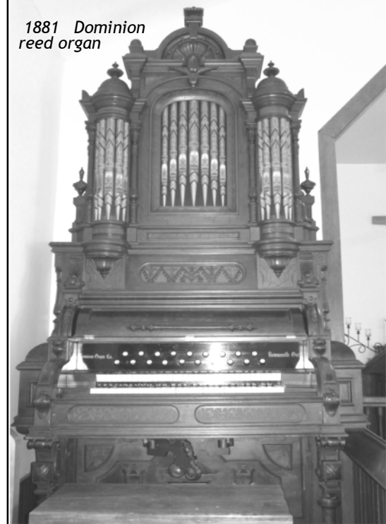
1881 Dominion reed organ

Tickets are $20 per adult and $10 per child, and advance tickets are strongly recommended based on the last recital, which sold out quickly. To order, call the Moore Museum at 519-867-2020.