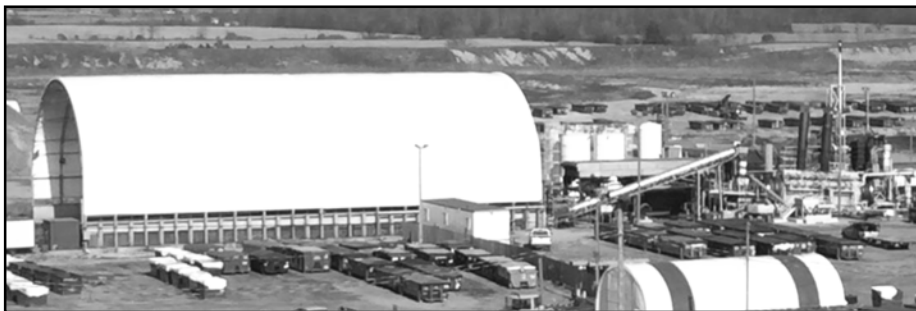
Thermal desorber unit, right, stands beside covered area where untreated organic materials are loaded onto a conveyor belt for transport into the desorber unit for processing.

When dealing with solid contaminated organic materials, a