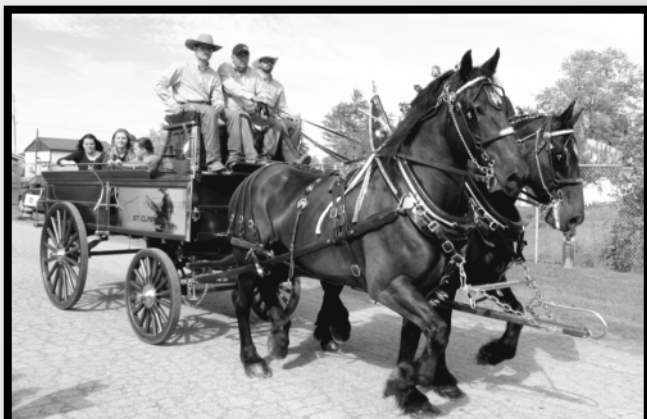
Above: The Brigden Fair parade included this majestic horse and wagon entry from St. Clair Mechanical.