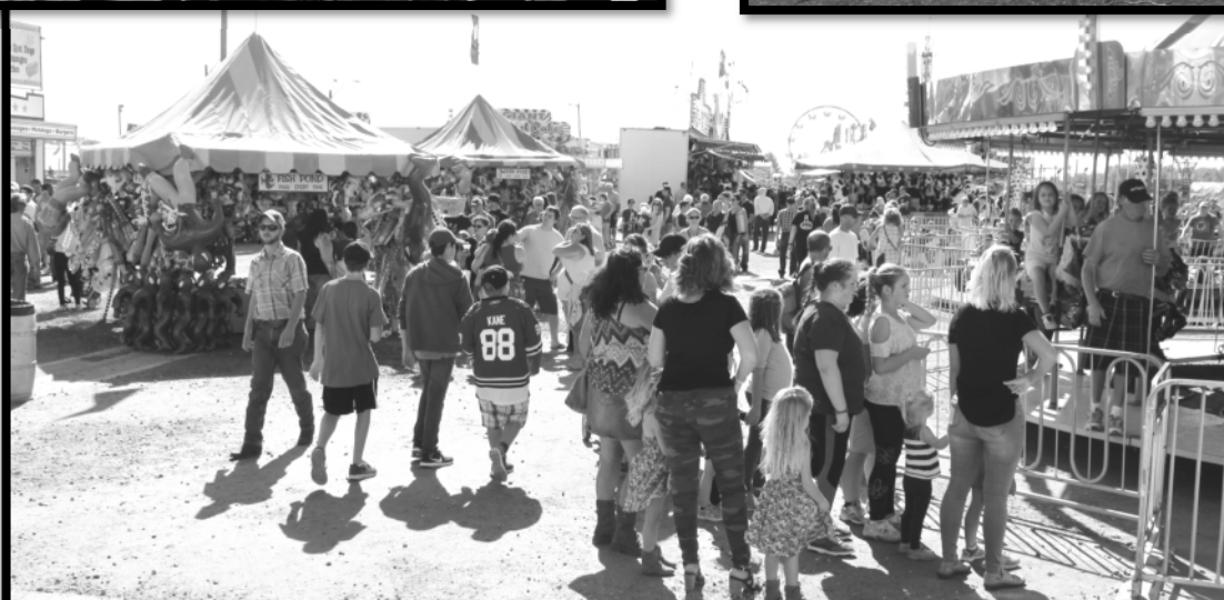
As always, the World's Finest Shows midway was alive with vibrant colours, the tempting smells coming from the food vendor stalls and vehicles, and the delighted squeals of happy kids negotiating with their parents for one more ride or one more game.