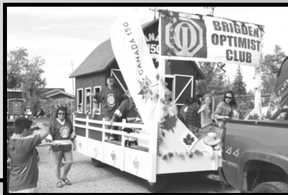
Above: The Optimist Club of Brigden brought along an entire barn as part of their fair parade entry.