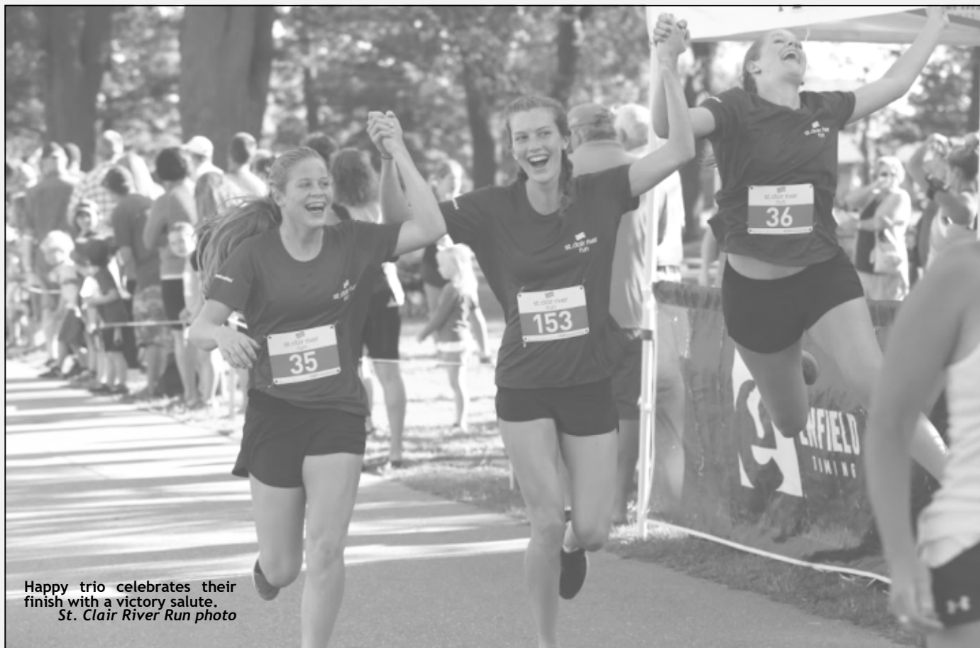
Happy trio celebrates their finish with a victory salute.