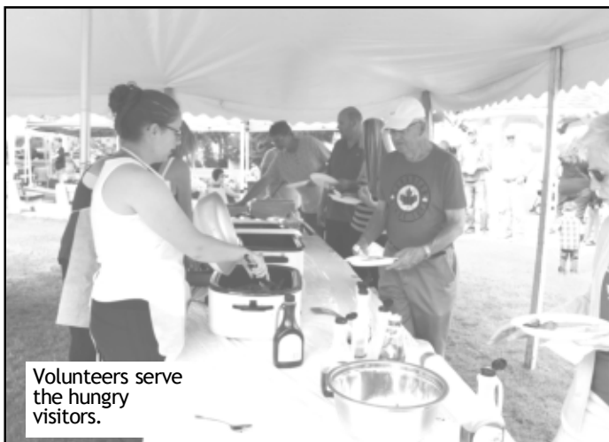
Volunteers serve the hungry visitors.