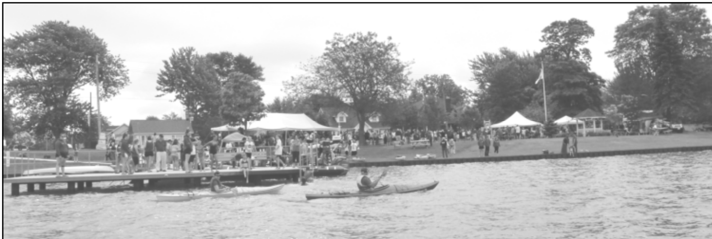
The Sombra shoreline teems with village residents and visitors to the new Sombra Community Dock during its grand opening.

Sombra area residents owe a vote of thanks to the Sombra Sports and Rec group for spearheading the project, and to the members of the Sombra Field Board, the Sombra Optimist Club and the many individual volunteers who helped with fundraising and the production of the memorable July 1 grand opening event.