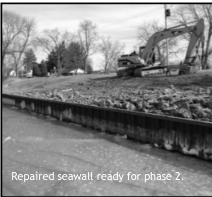
Repaired seawall ready for phase 2.