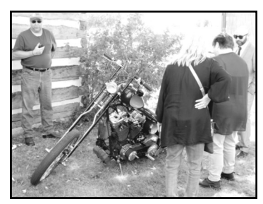
This custom "chopper" drew a lot of attention from museum visitors.

grounds of the Moore Museum on Sept. 25. Instead of black leather and chains, the "gang" wore business suits and clothing you might encounter in the halls of academia.