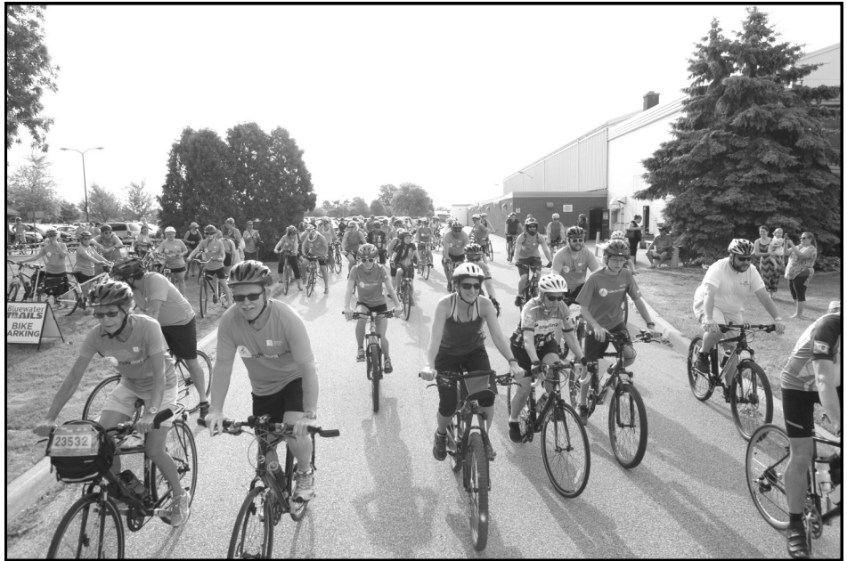
Some of the 330 riders entered in the Lambton and Kent Ride Don't Hide event set off from the Mooretown Sports Complex.

The Ride Don't Hide event brings this often debilitating and frightening illness out of the shadows and educates the public about the realities of mental illness. It is championed by many high-profile sports figures and celebrities who have either personally