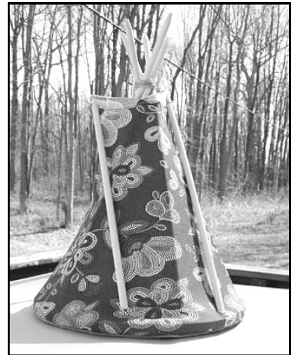
Colourful nature motif tipi

The tipi night lights are available in a wide variety of designs from traditional Native American to contemporary images such as Disney and sports team logos. Mr. Redmond says tipis can also be made to order for team, business, organization, and personal occasions. The tipis can be purchased at the Turtle Soul shop in the main mall on Walpole Island, just across the main bridge that connects the island to the mainland.