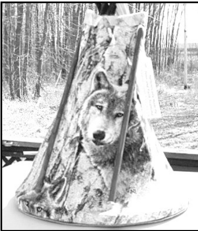
Wolf motif tipi