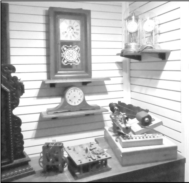
Your "timely" donation of a wind-up clock will help the Moore Museum expand the Hands of Time exhibit, seen above.

The Moore Museum's clock repair shop exhibit features fine examples of clocks from by-gone days. Donations of wind-up clocks are now being sought to round out the museum's collection. Anyone who has a clock they would be willing to offer should call the museum at 519-867-2020.