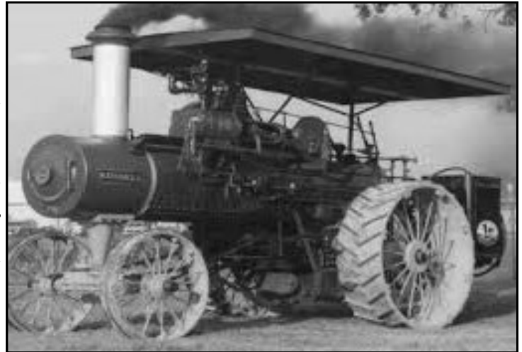
Antique tractors will shake the ground during Power Days.

Other events will include: tractor games, the children's pet show, frog jumping, the kiddie tractor pull, and pumpkin fest. Other events and features will include: antique working steam-powered displays, rope-making, food booths, silent auction, country music, 50/50 draws, flea market and craft sale (tables available by calling 519-683-2870), and the annual IODE chicken barbecue on Sunday at 5 p.m.