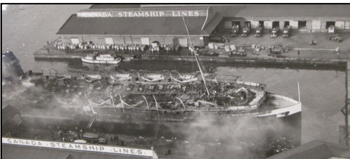
The once-noble S. S. Noronic sits in smouldering ruins at Toronto Harbour's Pier 9 on Saturday, Sept. 17, 1949.