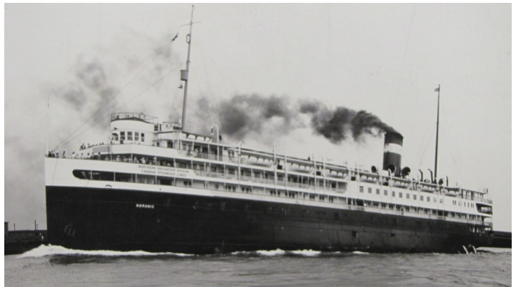
The S. S. Noronic steams down the St. Clair River carrying passengers on a thrilling cruise through the Great Lakes.