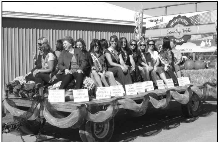
A float carrying past Brigden Fair Ambassadors graced the 2013 Brigden Fair parade. Will yours be as good?

Pre-registration is important for successful lineup organization and all it costs is $5, the regular Moore Agricultural Society exhibitor fee. All entries must be received by Friday, Sept. 26 at the Brigden Fair office, 2976 Brigden Road, Brigden, Ontario,