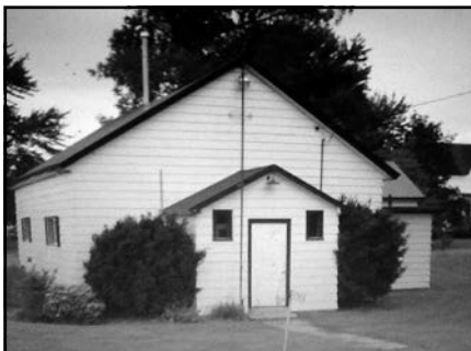
Moore Centre Hall

When membership declined substantially, the hall was given back to the township and has since been returned to the landowners.