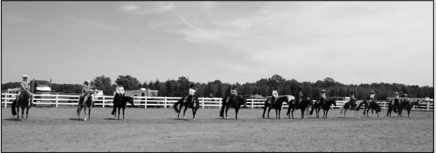
The Tri-County Midwestern Horse Show at the Brigden fairgrounds on July 5 included entries from all over southwestern Ontario and beyond. Above: Riders line up for a final salute at the conclusion of the competition.