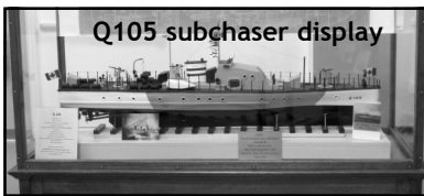
Q105 subchaser display

The Sombra Museum at 3470 St. Clair Parkway in Sombra Village will be the scene of several popular annual events this summer. The annual Lawn Concert will be held rain or shine on Sunday, July 6 at 7 p.m. Live country music will be featured and light refreshments will be served. Bring a lawn chair and enjoy! The next event will be the Blueberry Social, slated for Sunday, Aug. 3 from 1 p.m. to 4 p.m. Freshly baked desserts will be featured and there will be activities for the whole family. Admission will be by free-will donation. And on Aug. 16 and 17 weekend, enjoy free admission to the museum. Newcomers will be fascinated by the many local heritage artifacts, exhibits, and maritime displays, plus this year's World War I display being held to honour the 100th Anniversary of the Great War .