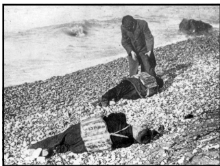
Many of the dead washed ashore on the beaches of Lake Huron.

The storm has other names, like the Witch of November and the White Hurricane , but no matter how fanciful a name you give it, the Great Storm of 1913 was a merciless killer that took 12 steel-hulled freighters to the bottom of the Great Lakes,