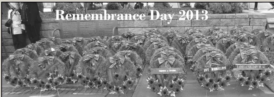
Row upon row of wreaths honouring those who served and those who died stand waiting to be placed beside the Corunna clock tower cenotaph. They were later taken to the Corunna Legion cenotaph on Albert Street.