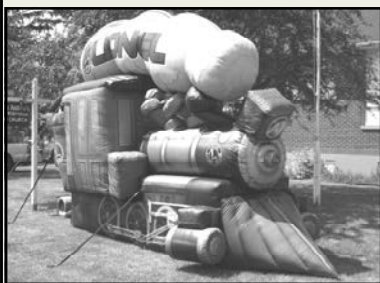
This large inflatable Lionel engine was one of two that welcomed visitors.

The weather was warm and the guests were many as the Moore Museum held the grand opening of two new exhibits. Visitors were greeted by two huge inflatable train engines in honour of the big reveal of the Lionel Model Train room. Volunteers have been working tirelessly to create a display that inspires curiosity and a train-enthusiasts spirit with trains of various gauges operating on a huge landscape layout that used to tour the U.S. to promote Lionel trains.