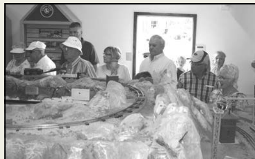
Curious visitors file into the new Lionel train room.