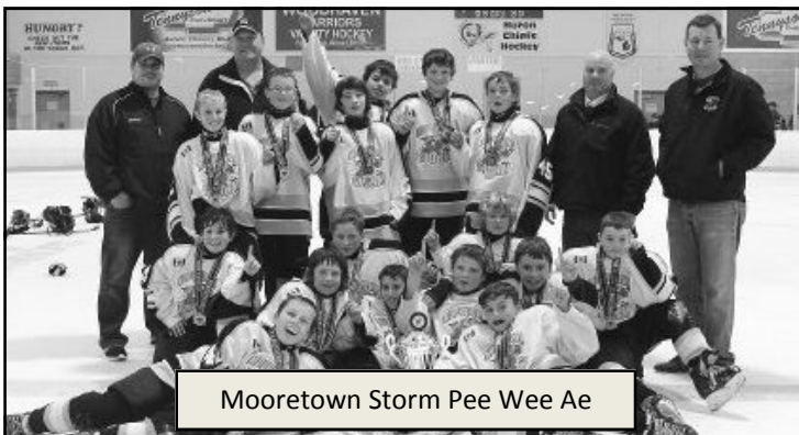
Mooretown Storm Pee Wee Ae

Congratulations to both of these teams and to all of the local teams who work hard and do their best each time they take to the ice!