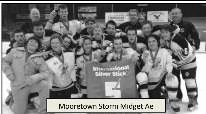
Mooretown Storm Midget Ae