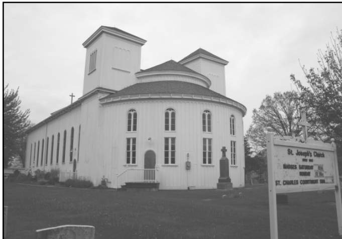
St. Joseph's Church has been a familiar landmark in Corunna and along the St. Clair River for 150 years.

St. Joseph's Church is the oldest existing Roman Catholic edifice in Lambton County. It