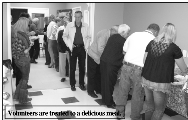
Volunteers are treated to a delicious meal.