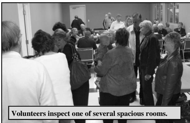
Volunteers inspect one of several spacious rooms.

Through the winter, volunteers will undertake the enormous task of moving artefacts from the current museum building across the street into the new building. Then, the old museum building will be returned to its original state as a grand old Victorian home known as the Bury House. When it has been restored, visitors will get the true feel of what Victorian home life was really like.