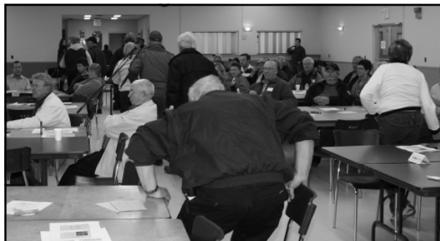
Protesting that the proceedings were a waste of time, about two-thirds of the group walked out of the meeting.