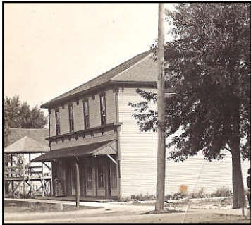
The Basswood Block as it appeared in Brigden.

In 1909, the building was purchased by Frank Carroll, who added a second floor for use as a roller skating rink. It was then known as Carroll Hall. Those who were on the first floor noted the