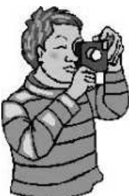
Photo contest highlights the St. Clair River to raise awareness

The Binational Public Advisory Board (BPAC) invites amateur photographers of all ages to submit photos featuring the St. Clair River to the Celebrating the St. Clair photo contest. There are three categories: Our Majestic Waterway , which focuses on the river's natural water, flora, fish and wildlife; On The Water , a visible tribute to the river's value for recreational, transportation and com-