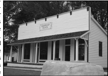
The Basswood Block as it appears today on the Moore Museum site.

In the late 1980s, the building was no longer required and was offered to the Moore Museum. The façade and as much of the other wood as possible was salvaged, and the building was later recreated on the museum grounds, where it can be seen today. It now houses a carpentry shop, a print shop, and a harness maker's shop as part of the Moore Museum's 12-building site.