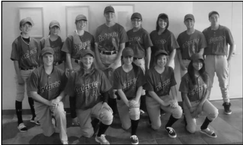
The Port Lambton Pirates in their Ontario Team 2 uniforms.