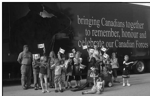
The children and staff of Sombra Township Child Care proudly welcome the mobile Portrait of Honour mural.