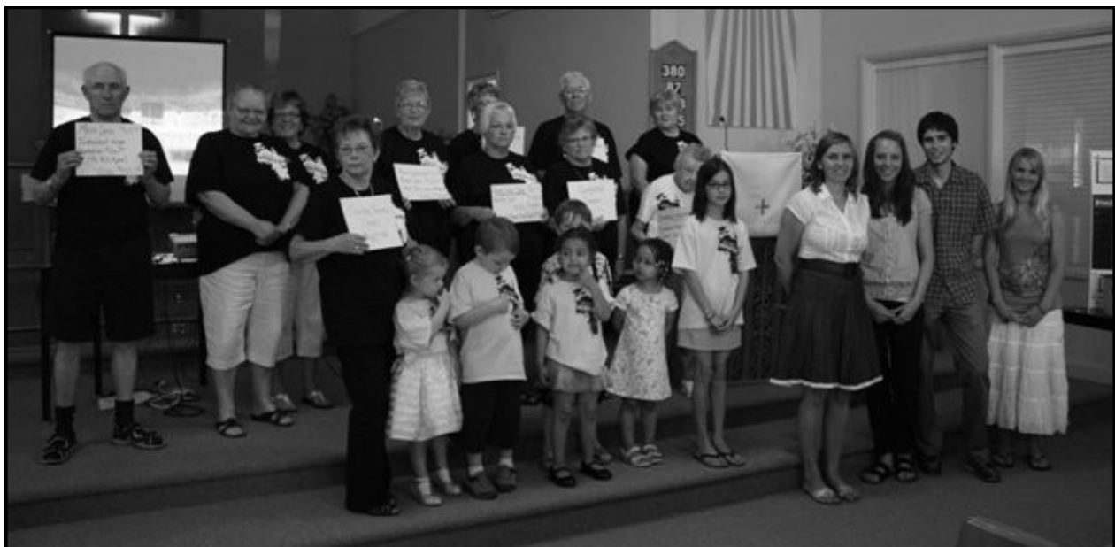
Four members of the MedOutreach team, right side of photo, with members of the Corunna United Church congregation who are showing their support by wearing special t-shirts for the occasion.