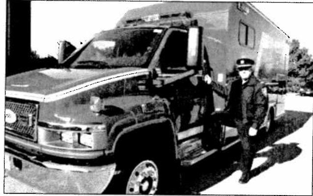
The new 2007 GMC Duramax diesel rescue/command centre vehicle recently made an appearance at the St. Clair Township Civic Centre with Corunna District Deputy Chief Tim Sparks at the wheel.

The combination rescue/command centre vehicle can carry eight firefighters, with six fully-suited firefighters safely buckled into their seats in the back service area. With immediate access to self-contained breathing apparatus (SCBA), these firefighters are ready to go into action as soon as they reach the scene of the emergency. The stainless steel-clad service area is also equipped as a command post, boasting a built-in 5,000 watt generator, refrigeration for an ample supply of drinking water, ample equipment storage space and built-in emergency/task lights.