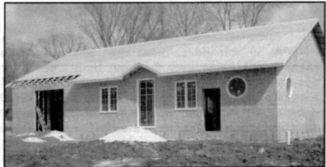
The new Courtright United Church is currently under construction at the corner of Fourth and Main Street.

Since the fire, the church's congregation has continued to worship together at St.